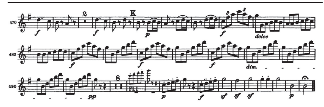
Beethoven - Symphony No. 6

Movement I: mm. 474-492 Clarinet 1 in B-flat